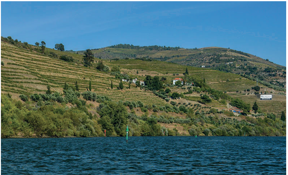
QUINTA DOS MALVEDOS: THE VINEYARD VIEWED FROM THE RIVER

Two quintas owned privately by members of the Symington family, Vila Velha and Vale de Malhadas, contributed small parcels of excellent quality grapes. At Vila Velha, the Vinha da Barca contributed its finest Touriga Nacional and Touriga Franca, which were co-fermented to capture the full expression of this west-facing riverside vineyard. At Vale de Malhadas, the production from the barely half a hectare sized Vinha dos Eucaliptos vineyard provided elegant floral aromas from Touriga Franca grapes.