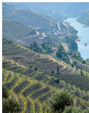
QUINTA DOS MALVEDOS

As a result of the adjustments to the picking plan, each vineyard at Malvedos and Tua was picked at optimal ripeness. The Valdossa vineyard, high above the Malvedos estate house, produced superb grapes from its 30-year-old Touriga Nacional, their maturity delivering wines of