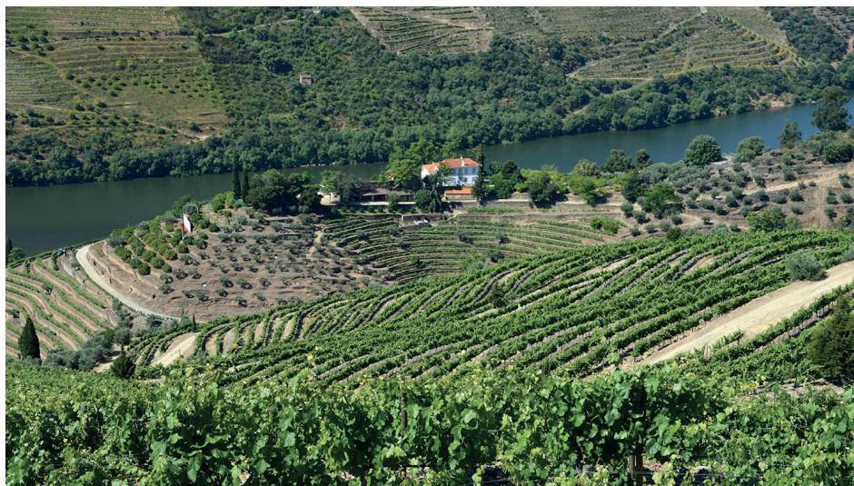
QUINTA DOS MALVEDOS: THE VALDOZZA VINEYARD IN THE FOREGROUND

The small volumes of this Graham's 2016 Vintage bottling consist of 6,325 cases, including 600 magnums, and 352 Tappit Hens. The Symington family derive great confidence from the promise that this beautifully crafted wine holds for the future.