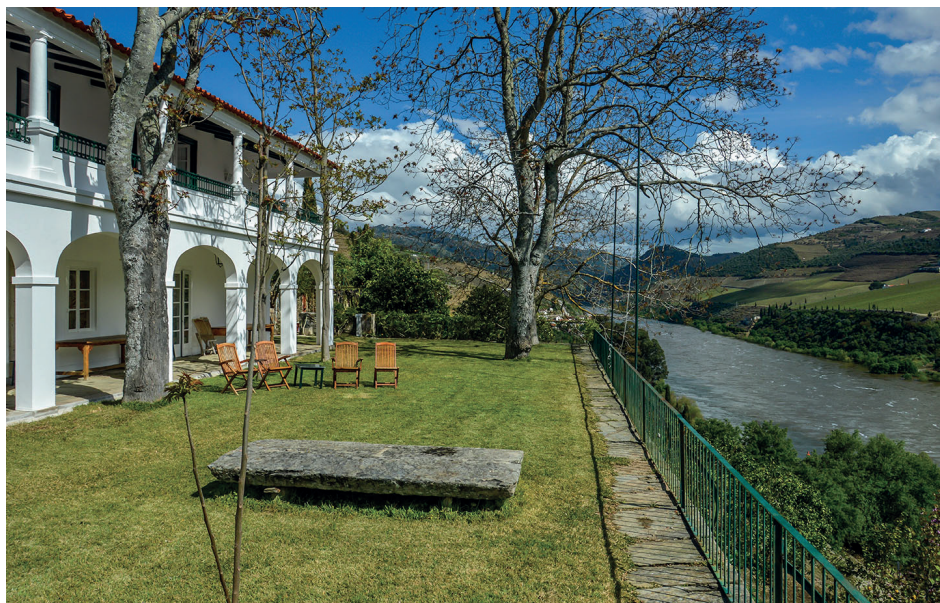
QUINTA DOS MALVEDOS, MARCH 2016: THE RIVER DOURO, SWOLLEN BY THE ABUNDANT WINTER RAINFALL