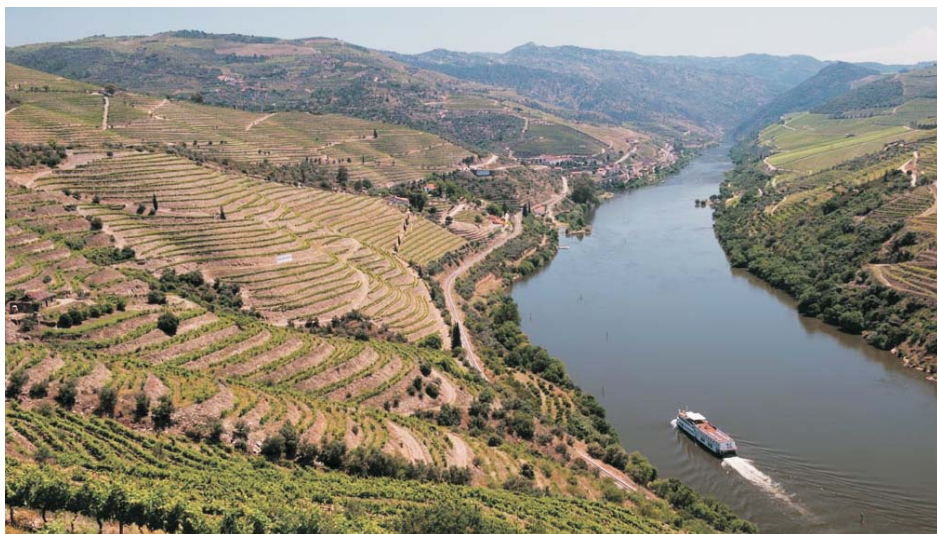
QUINTA DOS MALVEDOS AND QUINTA DO TUA