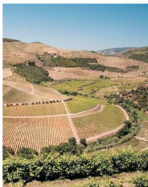
QUINTA DAS LAGES

The Graham's 2011 Vintage Port has been made from these five Graham's Quintas. All grapes were picked by hand and fermented in lagares (treading tanks). The total production in 2011 of the five Quintas was 1,454 pipes (799,700 lts) of Port. Charles Symington and his cousins have selected just 131 pipes (72,000 lts), i.e. 8,000 cases, after months of exhaustive tastings, to bottle as Graham's 2011 Vintage Port. The Graham's 2011 Vintage Port is from the very best wines made at these different Quintas, and represents just 9% of the entire production of the five Graham's vineyards.