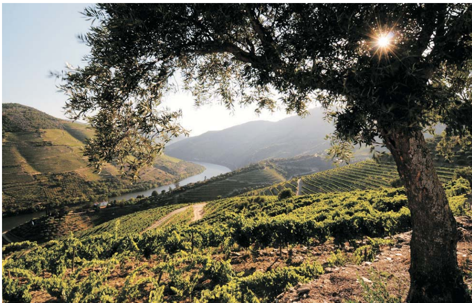
QUINTA DOS MALVEDOS